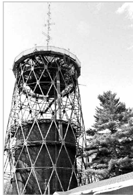
Top of tank with tower superstructure above it.

tower was re-purposed to become an underwater (yup!) research facility. From tracking the movement of missiles in the sky to testing underwater equipment seems quite a stretch but that is exactly what happened. And in fact, the two functions have some-