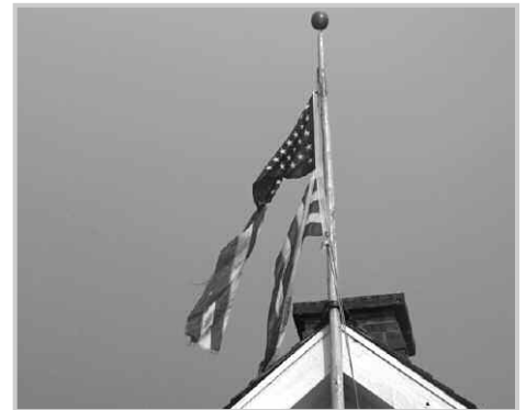
Flag ripped by Hurricane Sandy.