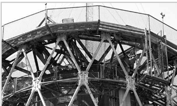
Radar tower top today with penthouse.