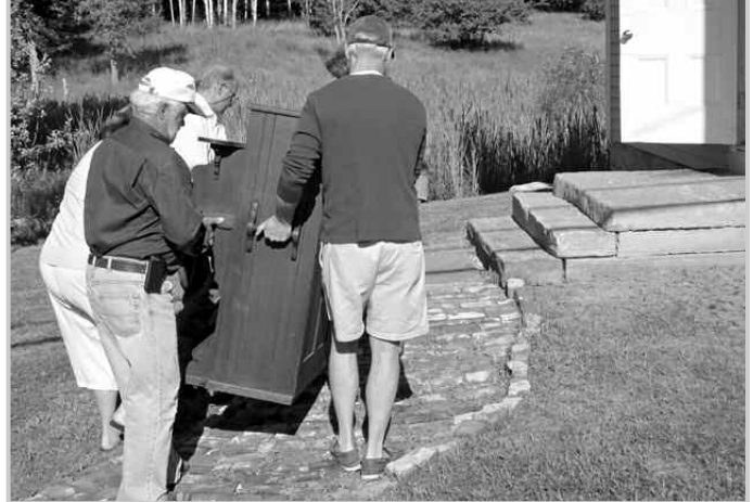
Volunteers carrying the pump organ into the schoolhouse.

We three daughters were each given one of the reed organs, and the rest went off in different directions. Without the musical ability, and not having much space for more furniture, I thought that the Littlefield School might be interested in having mine. I knew that one room school-