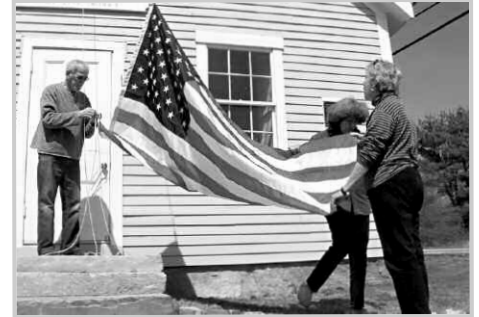
Setting up the new flag.