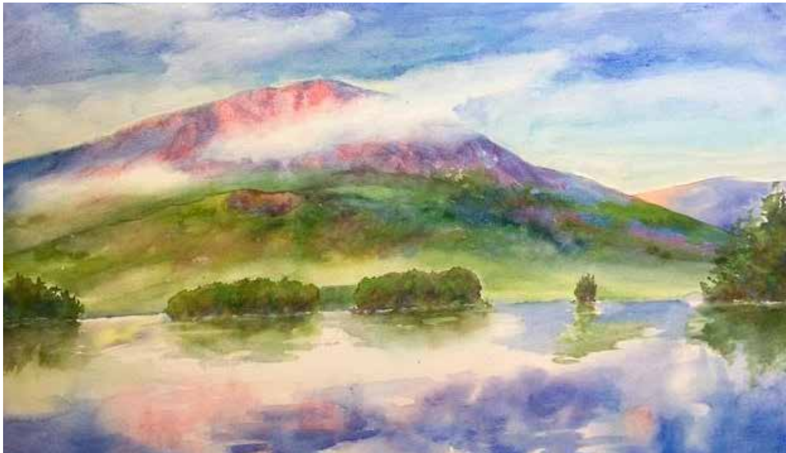
This photo is the completed version of the three iterations that Evelyn created during the actual filming. First, she started with just a drawing on stretched paper. Then she painted the mountain and middle ground. Then, the water reflections and sky. The last details were painted in the work pictured here, at the end of the video. . All will be included in Dunphy's Open Studio at 596 Fosters Point Road, West Bath, December 7th from 10 - 4 and December 8th, from 1- 4. Evelyn will donate 20% of all proceeds to the Children's Hunger "Backpack" program and the Morse High School Homeless Teens program.

Ed. note: To watch the video, go to Evelyn's website: https://www.evelyndunphy.com ■