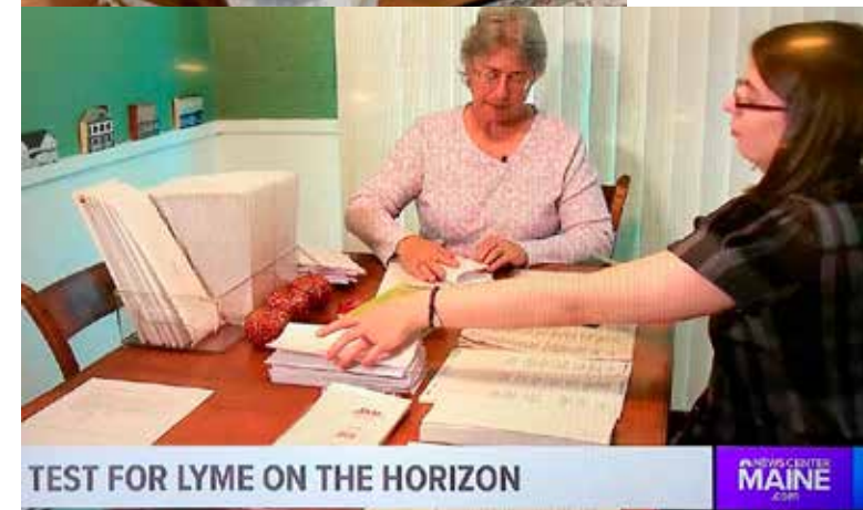
TEST FOR LYME ON THE HORIZON