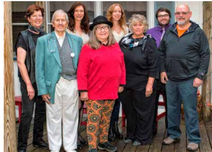
Cast members for Restless Shores.